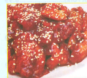
芝麻鸡 SESAME CHICKEN