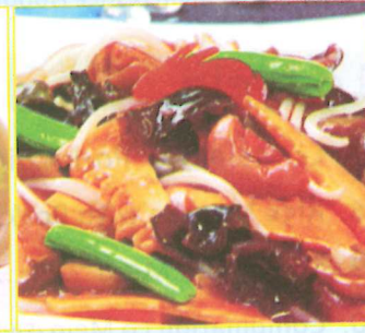
素什锦 MIXED VEGETABLE