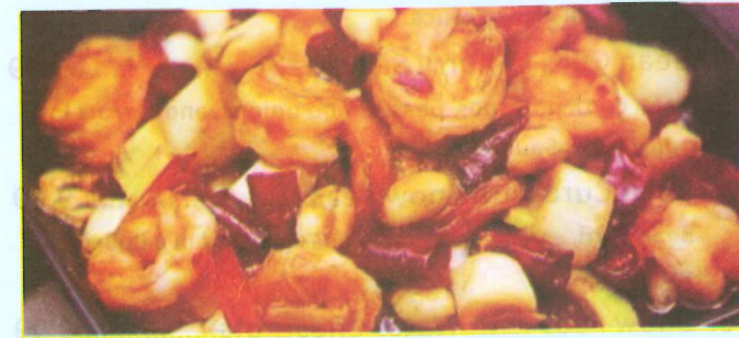
宫保虾 KONG PAO SHRIMP