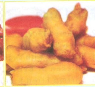
甜酸鸡 SWEET & SOUR CHICKEN