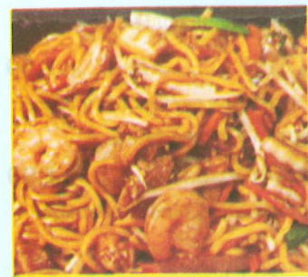
本楼捞面 HOUSE LO MEIN (SHRIMP CHICKEN 7 PORK)