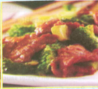
BEEF W. BROCCOLI