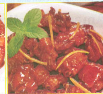
陈皮鸡 ORANGE CHICKEN