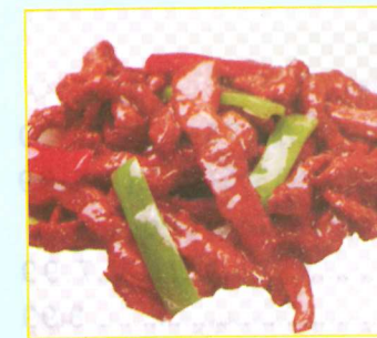
青椒牛 PEPPER STEAK